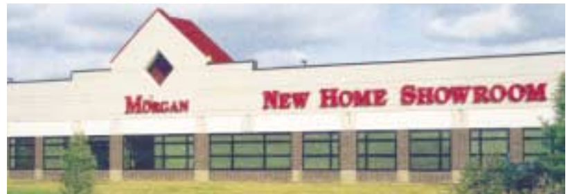
CP Morgan is building their company on the firm foundation of character development.

With a 98% customer satisfaction rate, C. P. Morgan Company has apparently found the “real deal.”