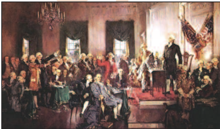
James Madison contributed many ideas during the Constitutional Convention of 1787. He is known as the "Father of the US Constitution."